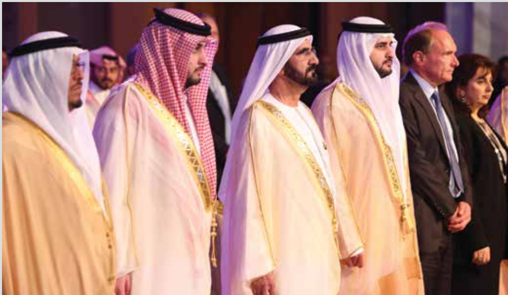
left: Mohammed bin Rashid, Maktoum and Ahmed bin Mohammed during the opening of the first edition of the Knowledge Summit

transferring knowledge. The summit has become a reference point for specialists and decision-makers when drawing future policies. In a short time, the Summit became an ideal global platform to discuss ways to instill a culture of building sustainable societies and economies.